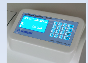
Easy to operate through a menu driven system, display of setup & measuring parameters on a large LCD screen.

Specifications and Designs are subject to changes for improvement