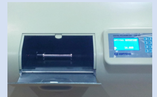
Spacious sample compartment for the convenience of sample handling & cleaning