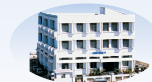
State Of The Art Manufacturing Plant